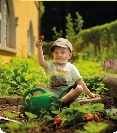
Childcare for babies and toddlers (ages 0-3)

In our nursery, children receive personalised care in a warm, family-like setting. Our trained professionals nurture each child’s physical, emotional, and cognitive development. We facilitate growth through engaging activities like playful exploration, music & movement, sensory experiences, and everyday tasks designed to encourage language, motor skills, and independence. Through positive peer interactions, children begin to form their first friendships and steadily build their confidence.