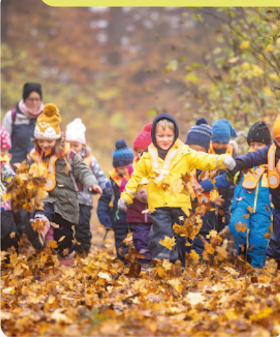
Early childhood education (ages 3-6)

Our programme is based on the International Baccalaureate Primary Years Programme (IB PYP), which uses inquiry-based learning to support children’s overall development.