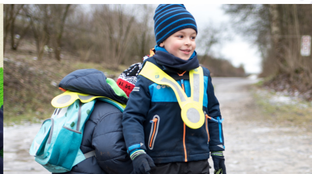
Early Mathematics Tuition