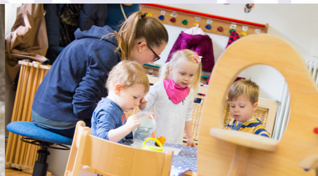
Early Language Tuition