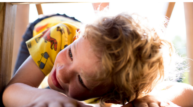
Bilingual all-day care