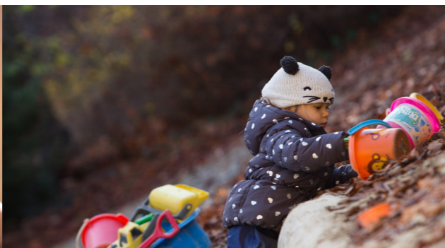
Big outdoor play area